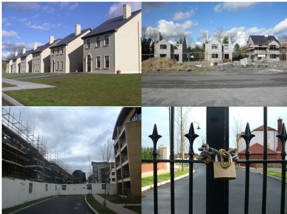
Figure 1 Top left, Leitrim, March 2010; top right, Roscommon, February 2010; bottom left South Dublin, January 2010; Fingal, January 2010

have never been occupied and contain no traces of previous inhabitants. Thus, they constitute a form of ruination different from traditional ruins; whereas in the latter capital has extracted value and moved on to a new spatial fix, in unfinished estates investment capital has melted into air before value can be extracted. Here ‘ruin’ is used to describe buildings that are being left to fall to pieces not because they themselves have lapsed into disuse, but because the speculative future that they as financial investments promised has lapsed into disuse. Thus, unfinished estates offer both an example of the ‘new ruins’ created by the accelerated creative destruction of financialized capitalism, and a physical manifestation of the ‘ruined’ future promised by the Celtic Tiger project. In the rest of this essay, we detail the characteristics and geography of such estates, the various problems afflicting the estates and their residents, and the Irish government’s response to these problems. Drawing from this discussion, we extrapolate on the material and discursive role these ‘new ruins’ perform in the (re)formation of Ireland’s post-Celtic Tiger landscape.