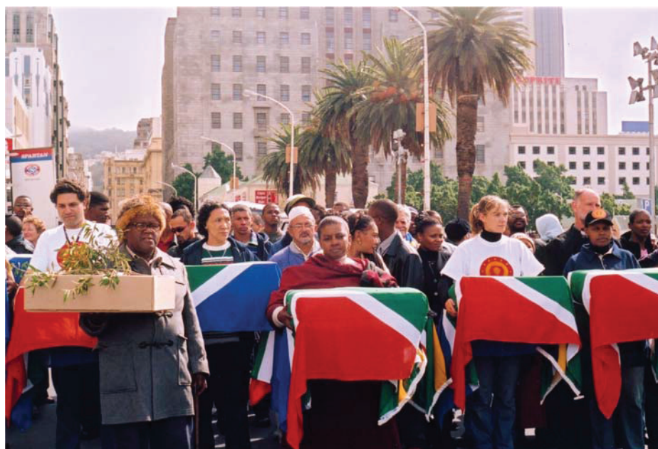
Fig. 4. 'Hands Off Prestwich Place' citizen protest actions, Cape Town, South Africa, 2003.