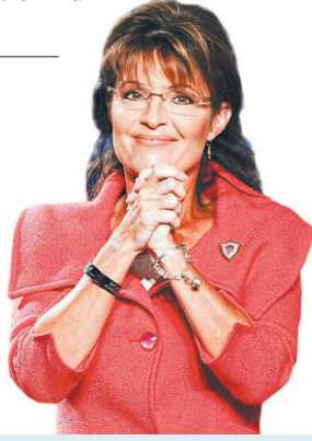
SARAH PALIN ON ARNOLD SCHWARZENEGGER

'I feel so bad for his children. It must be quite embarrassing for them, and, you know, it's an irresponsible and pretty disgusting thing that he did, pretty much denying that he had a child for 10 years.'