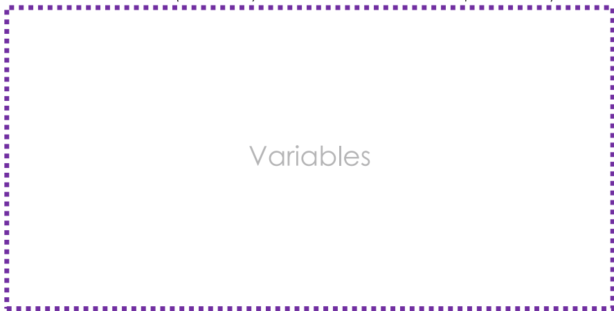
Fig. 2 Steps to inquiry: Planning our investigation (Smarter Science™). Interactive diagram for Step 2

- Brainstorm (Place sticky notes of a new colour in the square below.)