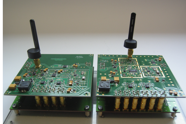
Figure 3 Low cost experimental SDR system from IMWS NUIM

This platform will let us investigate various radio architectures that are amenable to the TETRA-WiMAX system. Our two candidate architectures are a homodyne (direct-to-RF) transmitter and receiver, or a homodyne