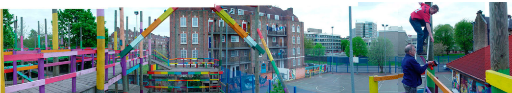
Figure 3 Setting up OWN aerials in Adventure Playground. Deptford (Source: sps.org archive, Creative Commons license).

along the Crossfield Estate. This was constructed in 1930 as part of a first regeneration effort in the area, close to the docks and slaughterhouses on the Creek. A turning point in the history of the estate was the mid-1970s decision to favour occupancy there for young single professionals—teachers and students from the nearby Goldsmiths for instance. 8 This started a cultural shift in the area, a first wave of gentrification, that sat side by side with the local working-class population (Glass 1964, in Slater 2009).