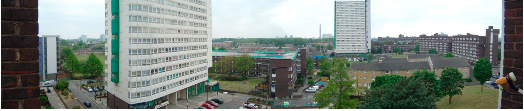
Figure 1 Pepsy Estate Deptford. Middle ground view.

accommodation and four additional floors with 14 luxury penthouse apartments. The story was captured over the course of three years in a BBC documentary entitled The Tower: A Tale of Two Cities , which won the BAFTA award in 2008. The Dickensian opening of this eight part series sets the pace of the documentary: ‘London, for the people who live here, it can be the best of times and the worst of times’ (BBC 2007). Wealthy newcomers are shown being taken to Deptford by boat. They are often filmed drinking wine and looking over the Thames, towards Canary Wharf and Greenwich Reach. The gaze of these new residents is turned away from inner-city Deptford, which remains a cause of concern for their own safety. The loud presence of the locals is often felt, but only from the safe distance of the tower heights (see Back 2009). Pepys Estate residents responded to the BBC documentary in a participatory video, funded by the Joseph Rowntree Foundation (Spectacle and JRF 2008). They exposed the BBC narrative as one that systematically profiled people and events as the poor ‘other’.