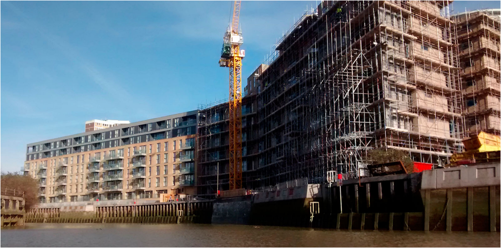
Figure 4 Deptford Creekside. View from the water (Source: Author's photo. Creative Commons license).

resource and that's what makes it a little bit more interesting.' To my mind, Pete's send-off further shows this disposition towards the commons, as circulation of affect. In their study of working-class personhood, Skeggs and Loveday (2012) invite us to think of 'value' not just in economic terms (accrual of various forms of capital), but also 'relationally, as a more general ethos for living, for sociality, and connecting to others, through dispositions, practices and orientation' (475–476). I would argue that