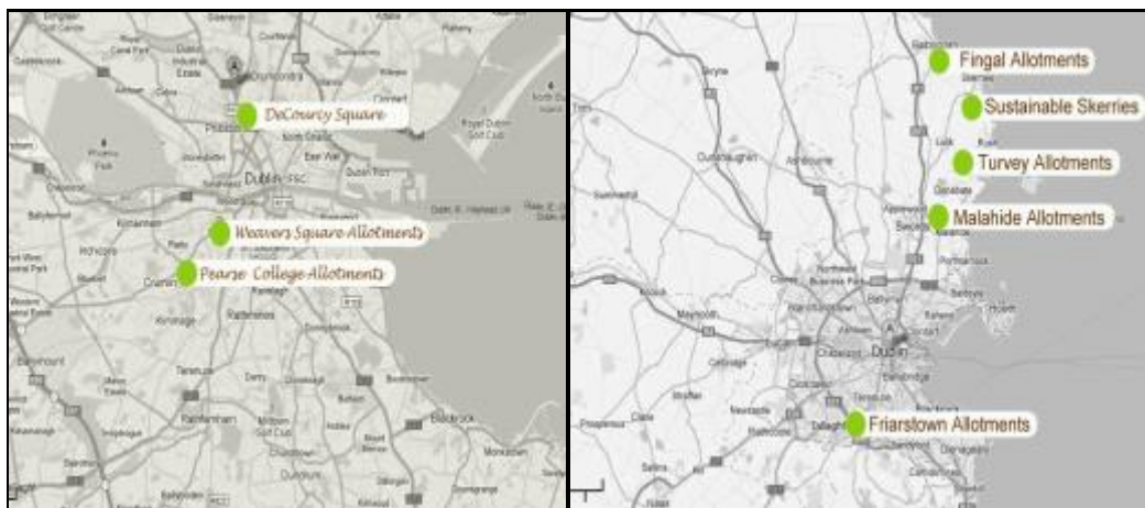
Fig. 2: Allotment sites in Dublin City Centre (left) and the greater Dublin Region (right)

In this paper, we offer an analysis of the growth in, and motivations behind, UA in Dublin and its relationship to the availability of vacant space. We gathered data through multi-sited, ethnographic methods (semi-structured interviews, participant observation and visual analysis). Fieldwork was conducted mainly between 2011 and 2013 in Dublin (across eight diverse locales in the city and on the perimeter), see Figure 2. Site selection reflected the rise in demand for UA, and the socio-economic profile of practitioners residing in each locale. In total, we conducted forty-eight interviews with plot-holders, fifteen interviews with advocates and five with providers (both public and private). Respondents who participated in the study differed in terms of a range of variables including: gender, ethnicity, social class, professional and occupational status, and length of time investing in UA. This paper draws on a sub-set of interviewees, namely, those plot holders and advocates who directly or indirectly referenced austerity and the economic crash in the course of their interviews.