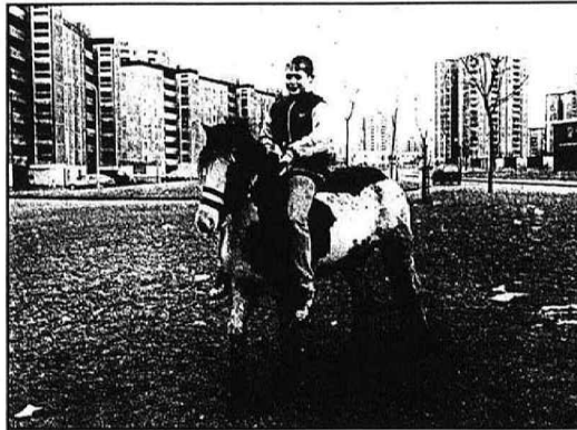
For the parents, the Dublin horse-eraze phenomenon has meant no needles, no cars, no crime; for the kids — freedom.

"We don't have the land to build houses, let alone care for the horses. Next week, the pet of the