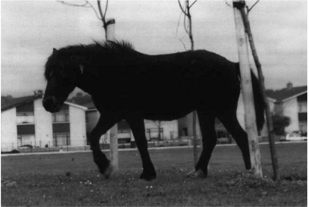
Figure 4 Suburban horse.

qualities of symbolically resisting structural violence, and invoking issues like identity and community ownership. Besides being kept as pets, they are competitively displayed in informal horse shows in the neighbourhood, as well as being a popular subject for many of the local wall murals (see Figures 3 and 4).