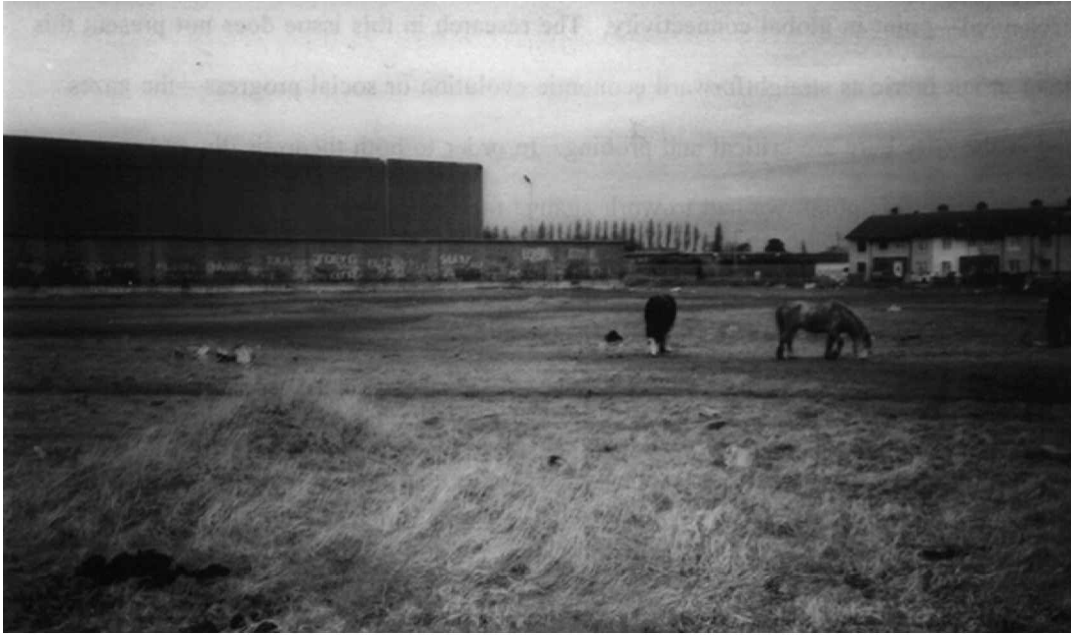
Figure 2 Site for the new Equestrian Centre in Cherry Orchard, Dublin.

programmes to date. They are financed, under EU targeted funds designed to mitigate 'social exclusion' directly from the Exchequer and they exist parallel to, if not truly independent of, government. In modern Ireland, such organizations are ubiquitous to all of the poorer neighbourhoods in the greater Dublin area and to most poorer neighbourhoods in cities and towns outside of Dublin.