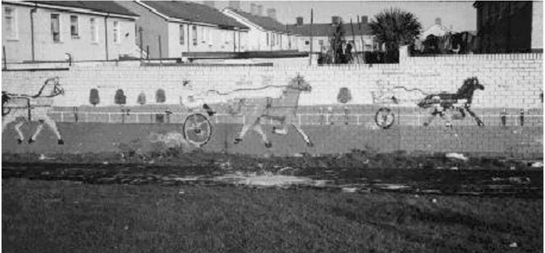
Figure 3 Wall mural in Cherry Orchard, Dublin.

board and operationalized the social exclusion discourse outlined above.