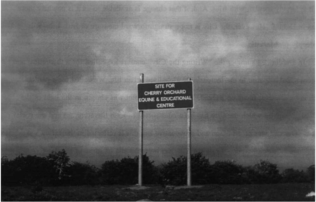
Figure 1 Site for the new Equestrian Centre in Cherry Orchard, Dublin.

The genuinely attractive idea is that there are strengths in any community and that these strengths can be built upon for socially desirable ends. Such language seems to promote an inclusive solution to problems by encouraging and (ideally empowering) various actors at the local level – business, residents, and representatives of statutory bodies and voluntary agencies (what in ‘Blairspeak’ in the UK are referred to as ‘stakeholders’) – to address issues as they arise. Finally, these policies seem to move away from top-down decision-making structures, associated with older understandings of governance and towards flatter ‘regulatory’ models of decision-making and action.